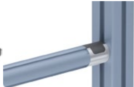
Set T-Verbinder D28, Nut 10 Set T-Connector D28, Slot 10